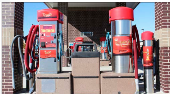
PICTURED: Executive Vacs, Islands, Garbage Can & Silver Bullet

Light Poles with LED Lights, Post Covers, Mat Holders